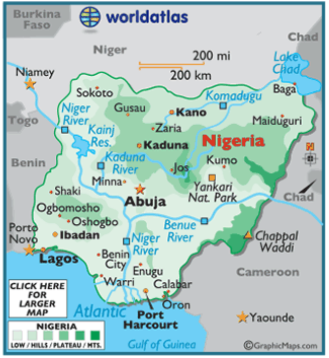
Figure 2: Map of Nigeria showing Abuja, Federal Capital Territory.